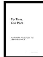
My Time, Our Place; Framework for School Age Care in Australia