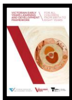
Victorian Early Years Learning and Development Framework

Approved learning framework: A document that outlines practices that educators and co-ordinators must use to support and promote children’s learning. The Early Years Learning Framework (Belonging, Being & Becoming) , the Victorian Early Years Learning and Development Framework and My Time, Our Place; Framework for School Age Care in Australia are approved learning frameworks for use in Victoria ( refer to Sources ).